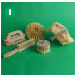
1 Selection of brushes