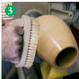
3 Hand brush being used